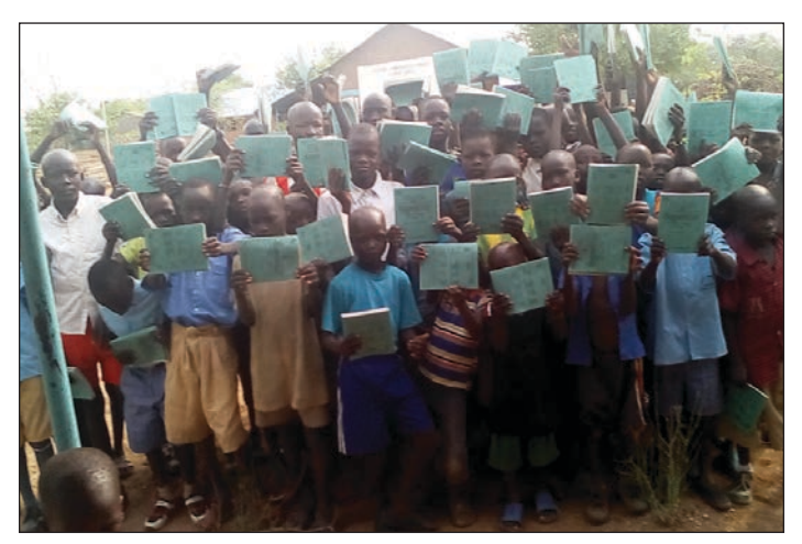
Your support saw 91 youngsters earn their kindergarten graduation certificates at St. Joseph's Nursery School.

St. Joseph's is run by the St. Martin de Porres Brothers. In addition to providing the children with school supplies such as books, pens, and paper, the school also gives them the most basic necessities needed to survive.