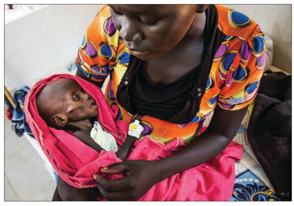
Your prayerful support helps us save God's people at risk of starving to death.

But between the ongoing civil war and lack of crops being planted, another deadly famine will engulf South Sudan in the coming months without immediate