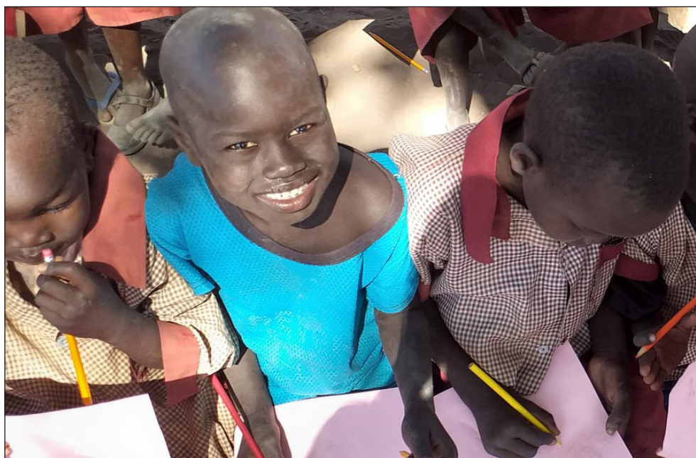
Children are thriving at Catholic schools in South Sudan thanks to the blessing of your Sudan Relief Fund donations.

school is a ray of hope and provides comprehensive support — a refuge offering protection, food, education, clothing, health care, and social and spiritual formation for hundreds of young girls. With the support of donors like you, Sudan Relief Fund has funded the school's food program for four years, helping to keep these vulnerable girls fed and safe.