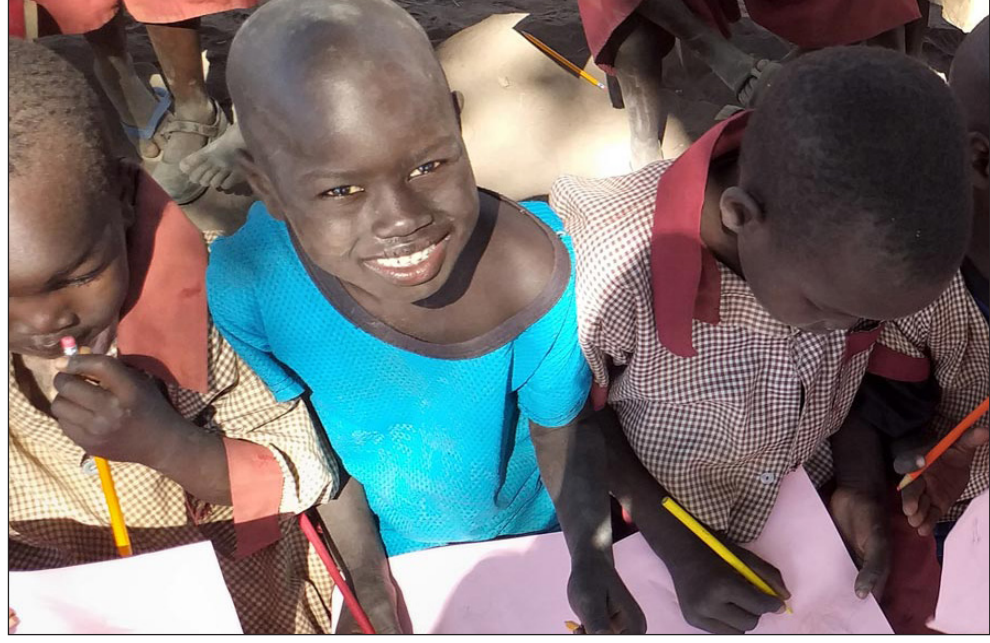
Children are thriving at Catholic schools in South Sudan thanks to the blessing of your Sudan Relief Fund donations.

school is a ray of hope and provides comprehensive support — a refuge offering protection, food, education, clothing, health care, and social and spiritual formation for hundreds of young girls. With the support of donors like you, Sudan Relief Fund has funded the school's food program for four years, helping to keep these vulnerable girls fed and safe.