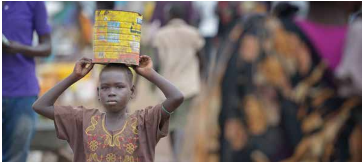
Together we're fighting hunger for over 325,000 child refugees who've fled the war.