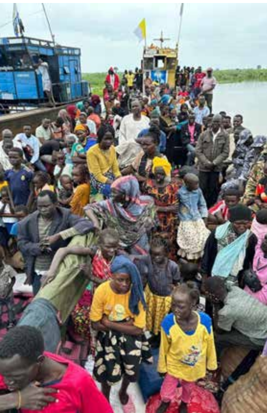
This boat transports 800 refugees to safety with each rescue trip.

“Behold, I am doing a new thing; now it springs forth, do you not perceive it? I will make a way in the wilderness and rivers in the desert.” - Isaiah 43:19