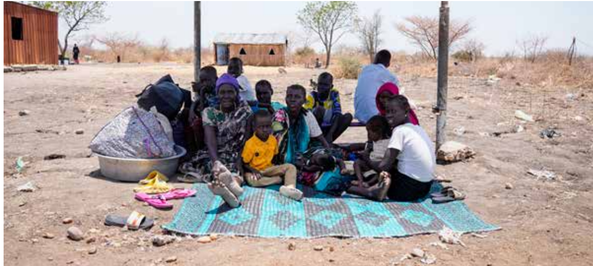
Your support brings critical food supplies and clean water to refugees fleeing violent warfare in Sudan.

Providing safe passage to refugees who will still face hardship might seem only a bittersweet comfort from a distance, but to those who receive that assistance it is a lifesaving gift, giving them courage and hope for the trials ahead. Christians are called to bring the love of God to all those "who sit in darkness and death's shadow" and to pave "paths of peace" in the wilderness (cf. Luke 1:68-79). With the faithful financial and prayerful support of our partners and friends, Sudan Relief Fund is committed to fulfilling this duty, whether by providing a "riverboat to freedom," by transporting medicine to remote regions for the needy and sick, or by welcoming the desperate sojourner from war to a new and secure home.