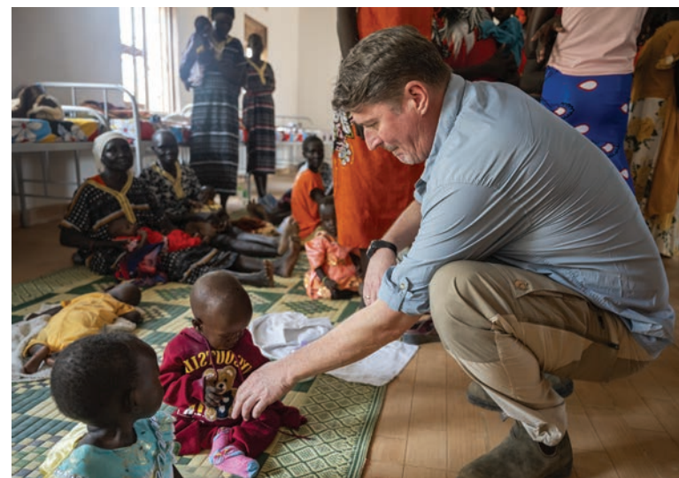
Missionary Sisters of Charity provided more orphans and abandoned infants a safe home