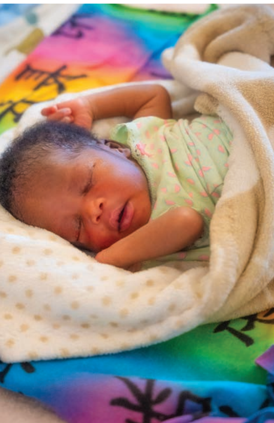
The Safe Motherhood project at St. Theresa Hospital is helping to defeat high childbirth mortality in Nzara