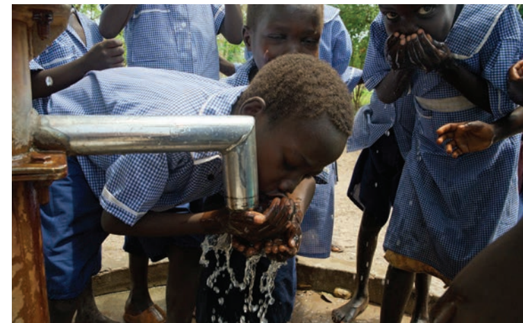
Your support brought more than 24 wells this year to communities without clean water