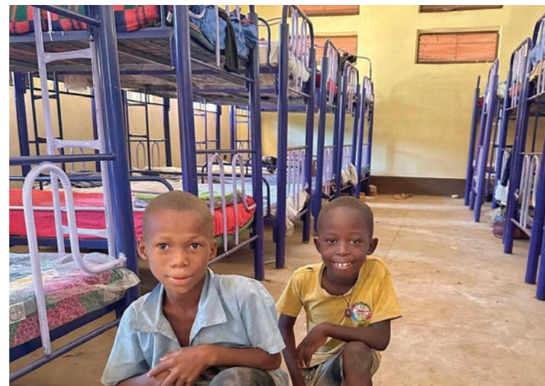
A bed of their own - a safe new home was constructed for 150 children at St. Bakhita Orphanage

This year our donor community expanded this facility to increase its capacity to help more young girls and orphaned children, constructing a multi-purpose area where all the residents can gather in one room for meals or worship – activities previously done outside because there was no other option. Your partnership is bringing care, hope, and a new future to these little ones who are precious in God's sight.