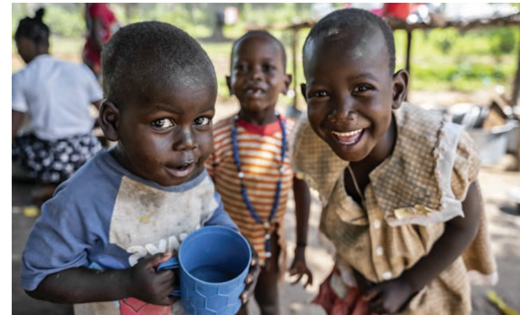
Clean water supports healthy children and benefits entire communities

In 2024 alone, you funded nearly two dozen clean water wells and sanitation projects, with more on the way, bringing healthy drinking water and enhanced sanitation to communities across South Sudan. The benefits of these health-giving wells extend to generations, making it one of the most effective long term ways to transform a community.