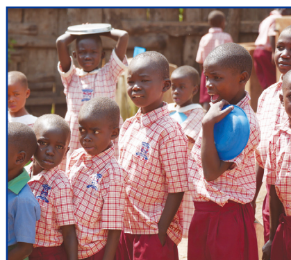
Our Lady of Assumption students.

Today, more than 1,000 vulnerable children are receiving a quality education here. More importantly, the school – and soon, its new well – has become a beacon of stability and positivity that many believed would never be possible in this battered region.