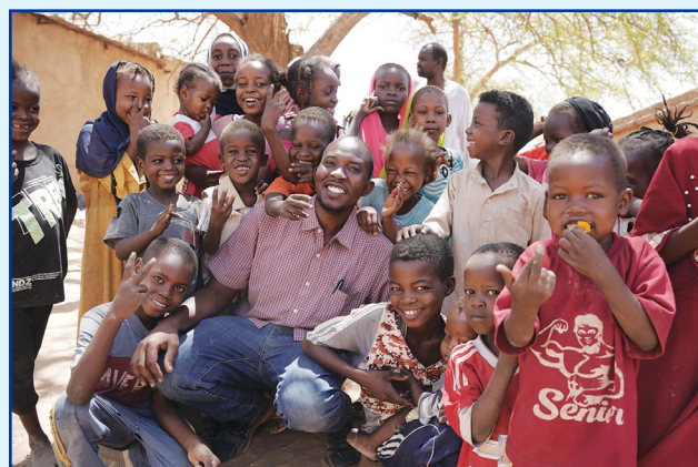
School children with their teacher.

the clothes on their backs, Redeemer School represents more than lessons in reading and math. It represents dignity, opportunity, and hope.