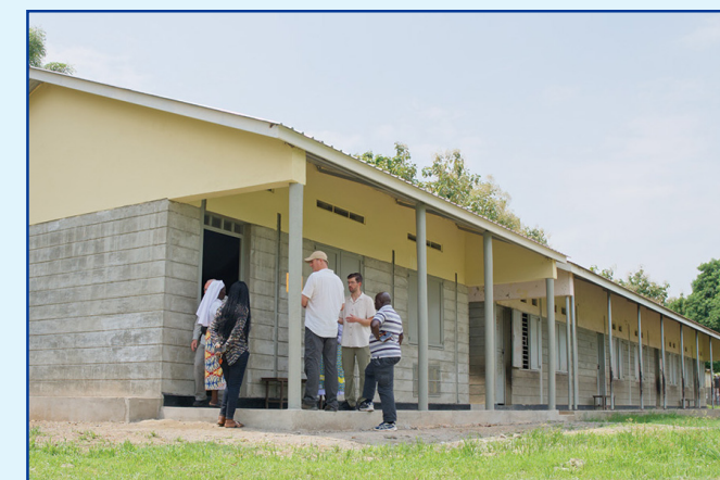
SRF staff inspecting a new school building.

here are learning that they are not forgotten—that God has a plan for their lives.