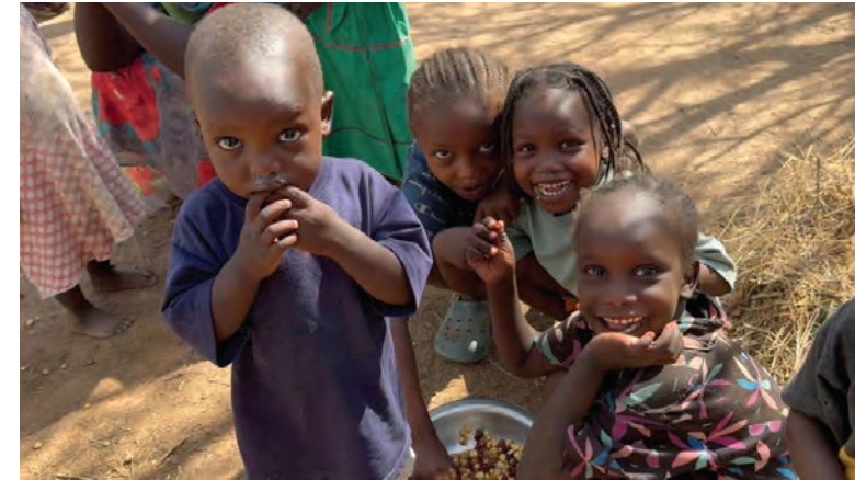
The new children’s ward at St. Theresa Mission Hospital is helping save young lives.

Exciting new developments are expanding healthcare and reaching more people during 2025 at St. Theresa Mission Hospital Nzara thanks to your partnership. Read the full report in our spotlight story on page 12.