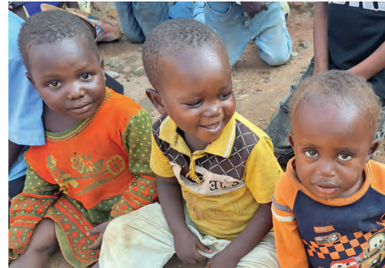
Not abandoned. Your support provides food, healthcare, and education for orphans.