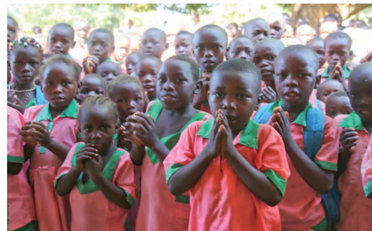
Igniting hope. Education changes the future for generations of young people.