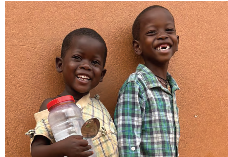
A reason to smile. Enjoying their brand new home completed this year.