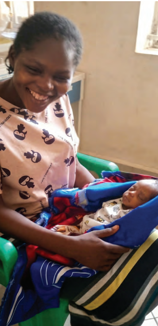
Pope Francis Center provides medicine and nutrition improving survival rates for children.