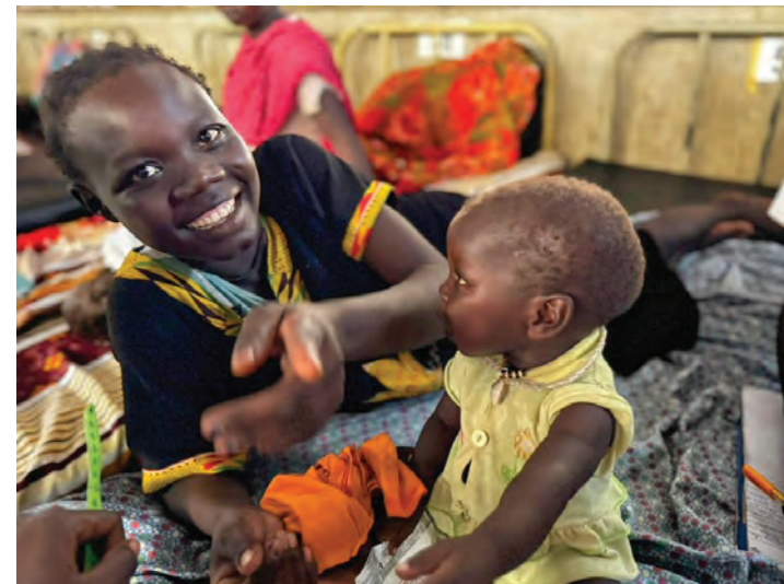
Restoring hope and futures for single mothers and young widows.