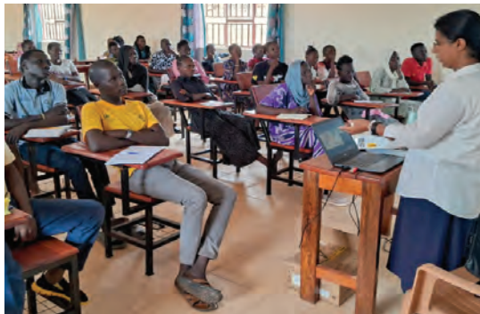
Vocational training provides a new start for refugees who lost their livelihoods.

Youngsters at Sacred Heart Nursery and Primary School in Juba , are benefiting from new classroom space. Due to heavy influx of Sudanese refugees and internally displaced, the school's population doubled in just two years, now serving over 1,000 students.