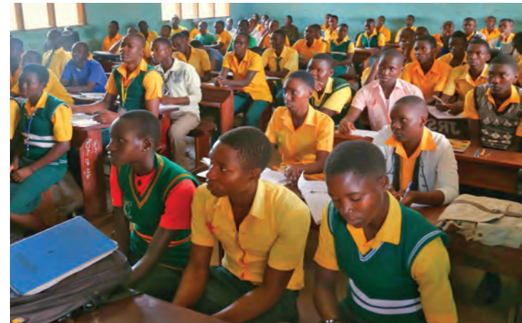
Your gift of education empowers these young lives with opportunity.

The remote jungle of Western Equatoria is the last place one would expect to find new businesses created – but that's precisely what's happening. Originally a refugee camp for the displaced, Ave Maria parish offers vocational training for families who lost their livelihoods when they fled, including carpentry, woodworking, and mechanics. This year two graduates launched successful new businesses in carpentry and woodworking. Your support makes these programs possible and gives new hope to those who have lost everything.