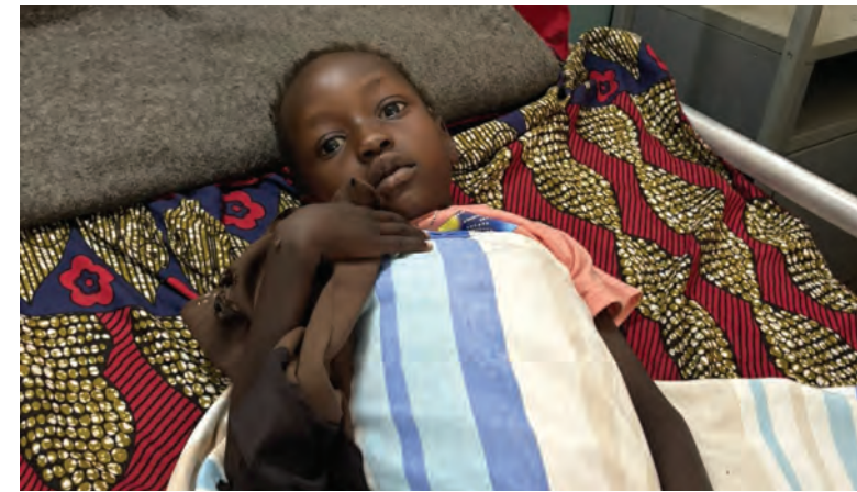
Your support delivered lifesaving care to three times more children at Mother of Mercy Hospital this year.