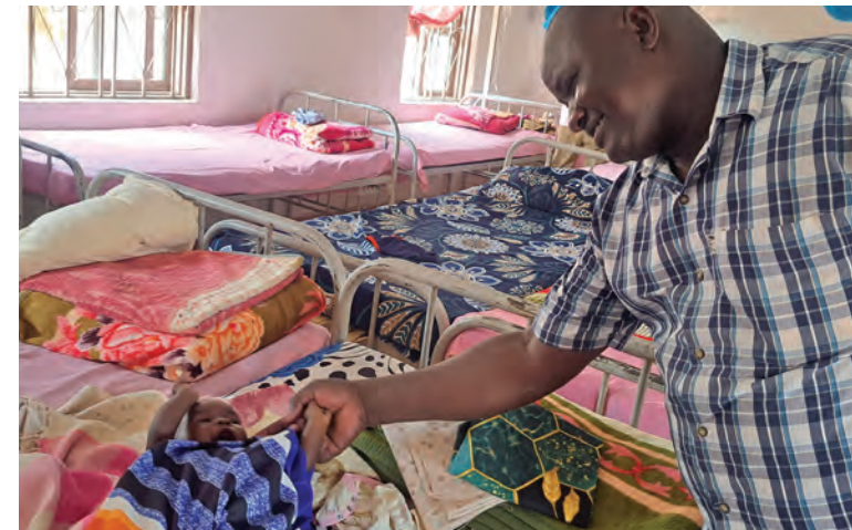
Brighter futures for babies through early access to health care.